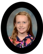
Maizy Nov 30