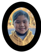
Tristan Dec 7